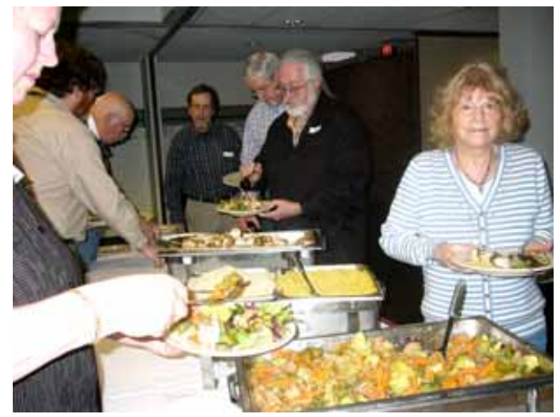
Good Food Line!