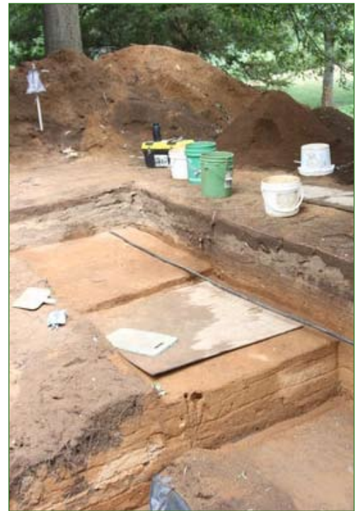
A view from the dig site at Pig Point where thousands of artifacts have already been discovered.