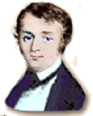
Jos. Nicollet (1836 Expdn)