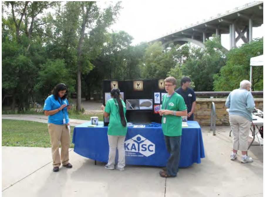
Science Museum of Minnesota students who are currently excavating the Sheffield site offer information. The Sheffield site was originally excavated by SMM in 1959 and 1960. A new investigation began in 2013.