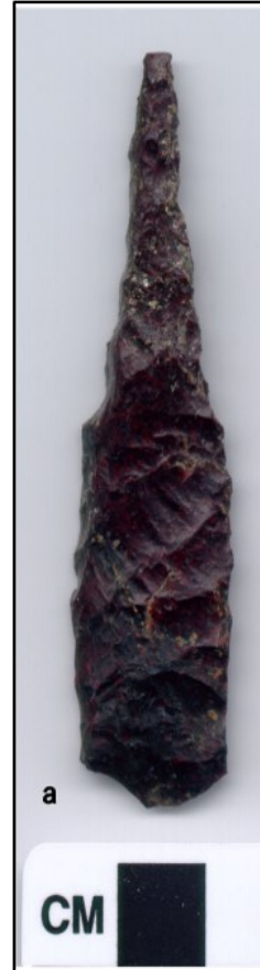
Jasper Taconite drill found at the Side Lake Beach site.