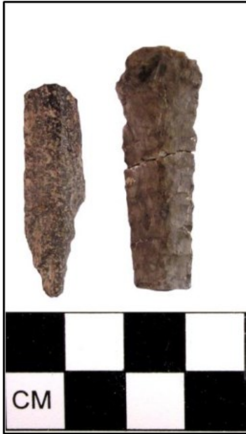
Jasper Taconite drills found at the Cable Bay Upland site