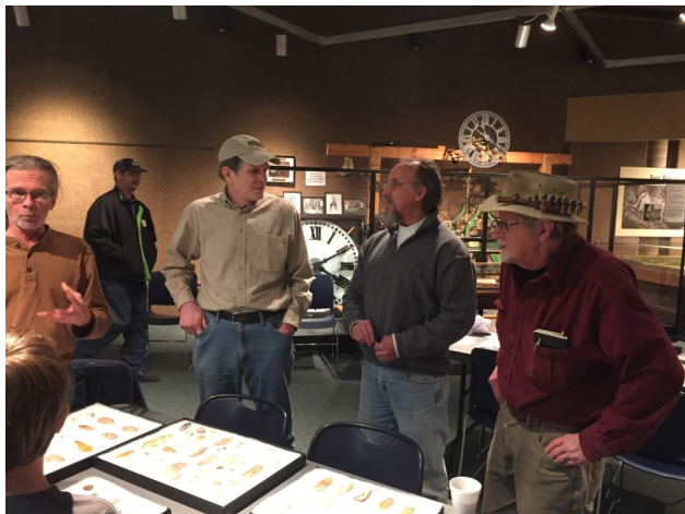
2018 Lithic Workshop, Fort Snelling Visitor Center

Board Changes: We will be affirming the 2018 Board of Directors at the annual meeting on April 20 th . We have made great progress on our goal of involving a new generation in the board of the Minnesota Archaeological Society.