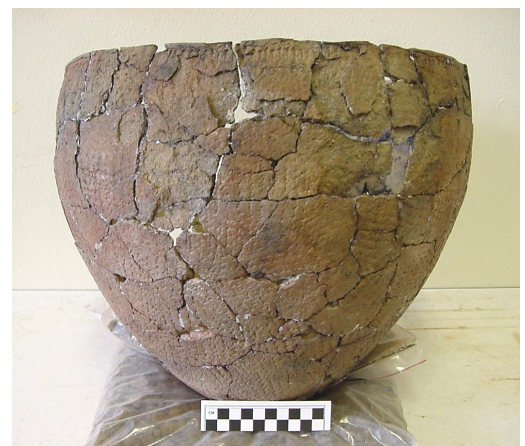
Reconstructed Brainerd Vessel

Both these projects provide a gateway to explore land use in the early reservation era. Egads, another landscape!