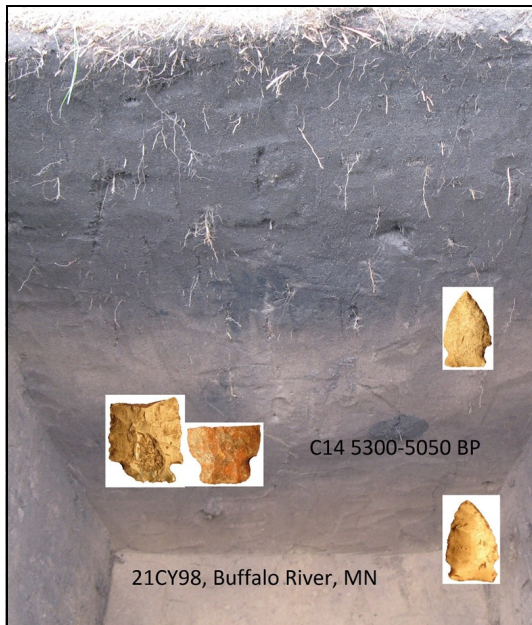
Profile of Archaic site in Clay County with stratigraphy of diagnostic artifacts and C-14 date.