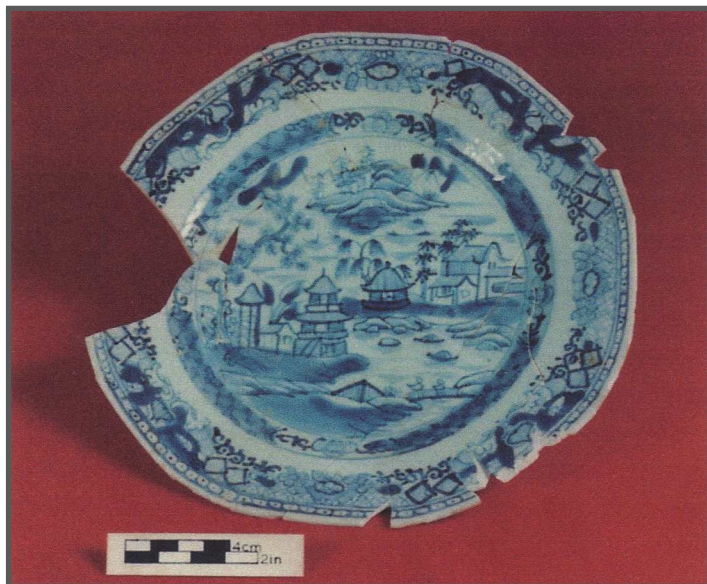
Chinese Canton ware export porcelain plate from the officers' latrine, Fort Snelling