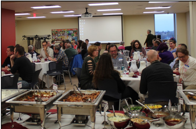
MAS members and guests visit while enjoying the “Taco del Seoul” buffet.