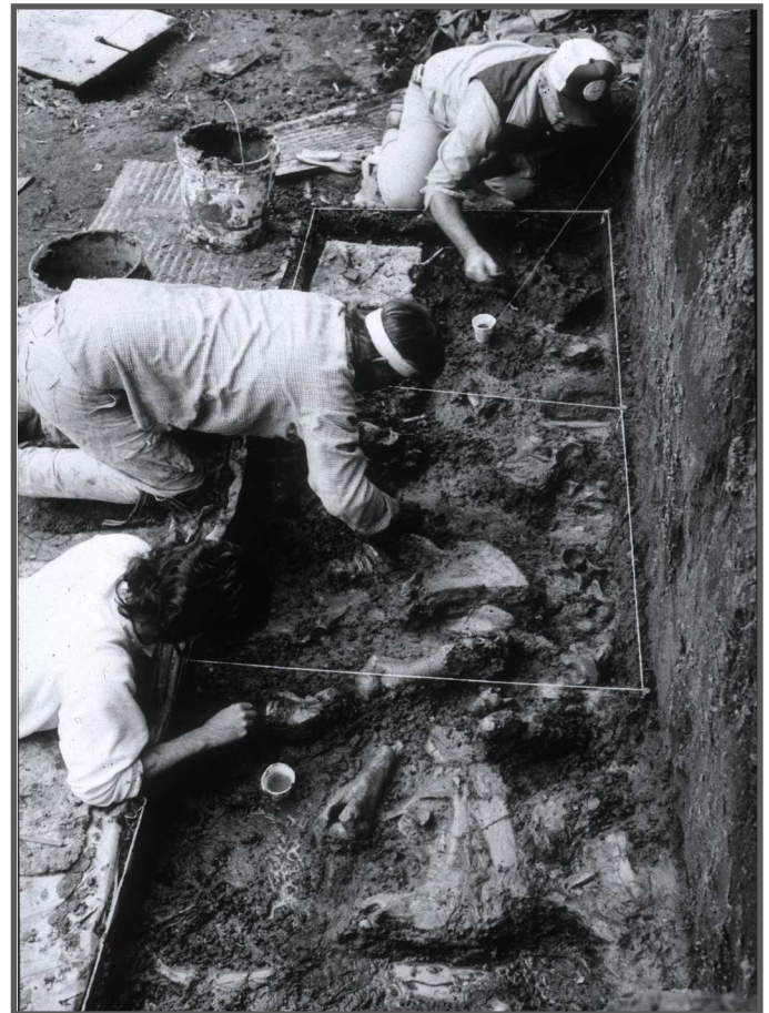
1990 field investigations in the Bison Bone Bed, 21YM47