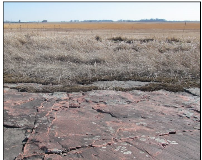
Red Rock Ridge