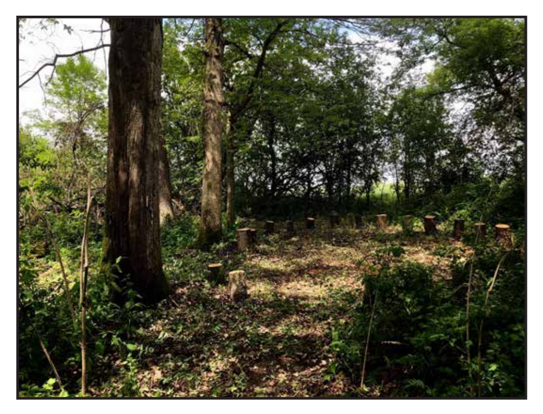
The new "Talking Circle" for classes and visitors along the trail

In June, after the quarry had been dormant for possibly 400 years, a ritual ceremony of gratitude was performed by three PIIC elders. Their song of thanks to the earth with voice and drum may have been a common event here for thousands of years, but it has been many centuries since those sounds, or the smell of the sage they burned while they sang, have been present in these woods.