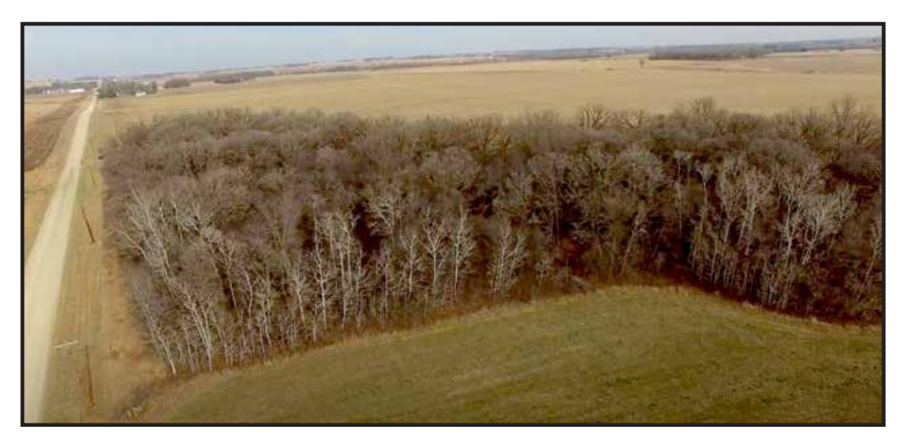
Drone view of the GMC Quarry

Three recent articles* in Vol. 77 of The Minnesota Archaeologist introduced the Grand Meadow Chert Quarry in southeastern Minnesota, and traced the use and impact of the significant gray chert that was extracted from that site over thousands of years. Now, forty years after it was first identified for the archaeological record, efforts are underway to open the GMC Quarry to the public in 2023 for a self-guided walking tour.